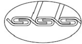
Cut-away view showing construction.